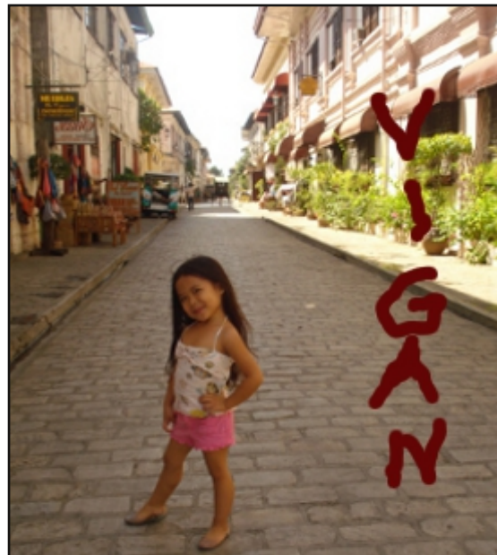
A great place to take a portrait of yourself...